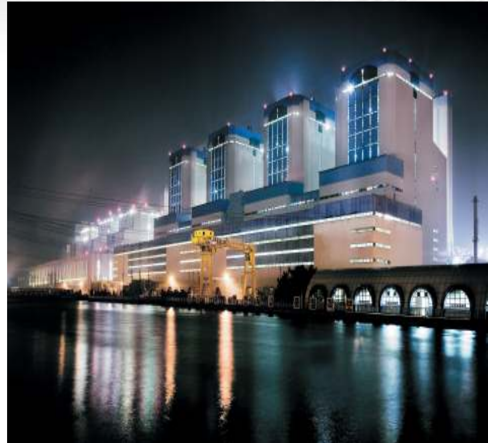
<Dangjin, Combined Coal Fired Power Plant>